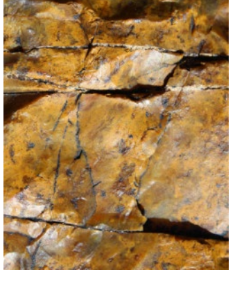
Responsible Resource Development Program