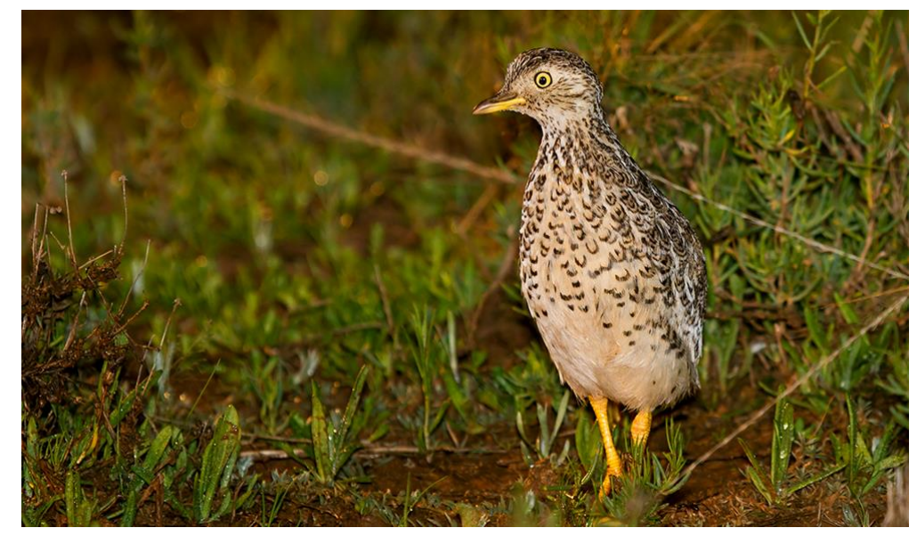
Critically endangered plains wanderer (Pedionomous torquatus)