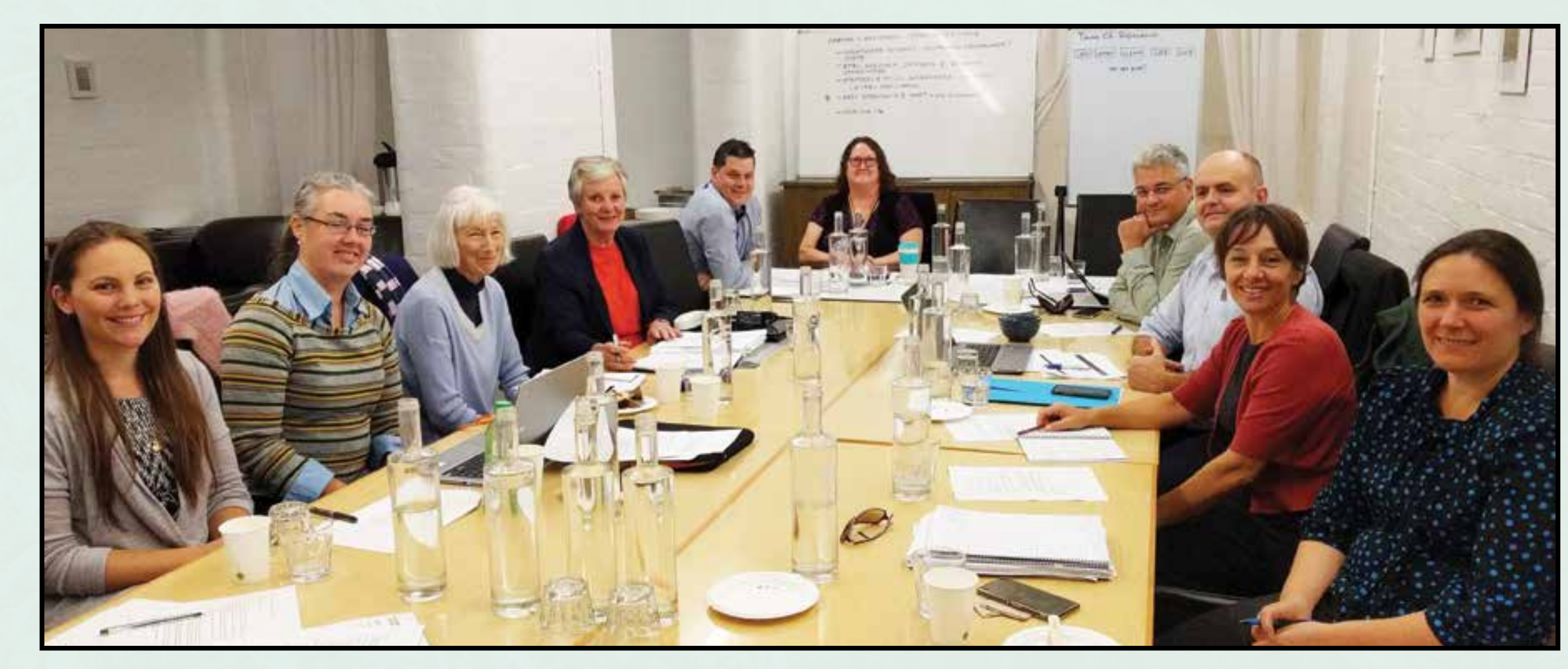
Above: The VREC includes PLAN members.