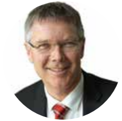
David Parker MP