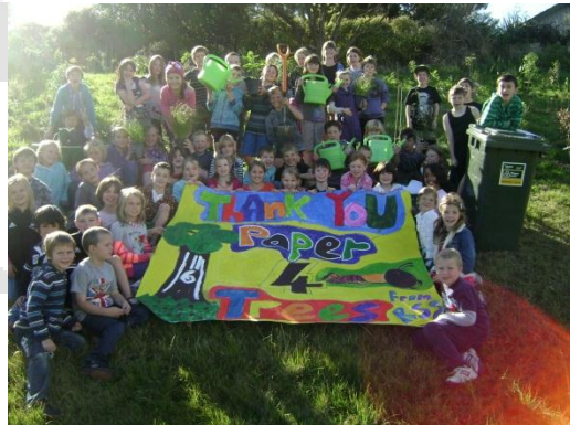
Raumati South School, Kapiti Coast.

Current Paper4trees sponsors vary and some include Port Nelson Ltd, Holcim (New Zealand) Ltd, Bayfair Shopping Centre, Shell Todd Oil Services, Norske Skog, Ziptrek Ecotours, NZ King Salmon, Waste Services Marlborough, Encounter Kaikoura, over 30 local councils and numerous other trusts. A big thank you needs to go to all of these sponsors who are helping to educate the youth of today for a sustainable tomorrow.