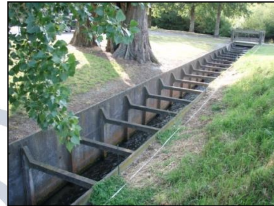
No. 2 Drain Bluegill Bully reach (before)

Fortunately, in this instance the CCC had the foresight to have a survey of habitat condition, aquatic invertebrates, and fish carried out prior to the naturalisation works. EOS Ecology designed and conducted this survey, which involved four sites (three within the naturalisation section and one control) being sampled once before (2006) and twice after (2008 and 2010-11) channel naturalisation works. Construction occurred mid-2007 to mid-2008. In 2010-11, the invertebrate survey occurred in December 2010 while the fish survey was done in March 2011 (after the February 22 earthquake).