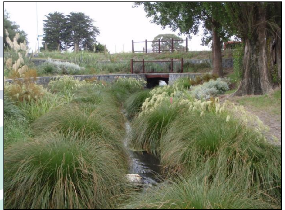
No. 2 Drain Bluegill Bully Reach - After Naturalisation Works (2010)

Earthquake footnote: The 22 February 2011 earthquake damaged the specially-designed bluegill bully section through lateral spreading of the banks, inputs of liquefaction smothering the coarse substrate, by changes to water levels, and reduction in water velocity. This has effectively reduced the area of suitable bluegill bully habitat and we are hopeful this section will soon be recreated to suit the needs of this special native fish.