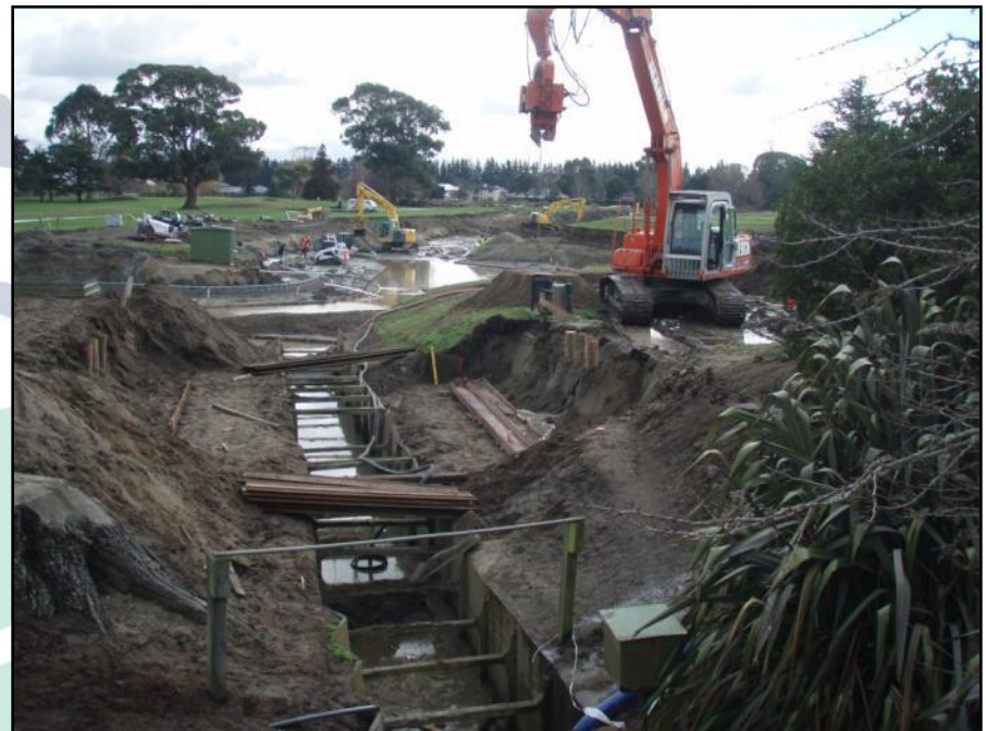
No. 2 Drain construction

Our post-naturalisation surveys have only encompassed 2.5 years of re-colonisation and it is possible new invertebrate and fish species may colonise given enough time. For a number of species however, there are likely to be limitations to natural colonisation (e.g. physical barriers such as tidal control structures, culverts, and urban areas, and the nearest source populations may be beyond the dispersal limits of some species).