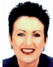
Clover Moore Lord Mayor of Sydney

Len Brown is the first to hold the title of Mayor for the amalgamated Auckland 'Super City'. He believes Auckland can be the most liveable city in the world, a city that delivers a strong economy with fair rates for all its people, a clean, healthy and safe environment their children will be proud to live in, better public transport to get people moving, and strong communities with strong local democracy. He is driving the positioning of Auckland as an innovation hub in the Pacific region. Len entered politics in 1992, when he was first elected to the Manukau City Council. He served as a councillor until 2004. He also served as chairperson of the Counties Manukau Health Council.