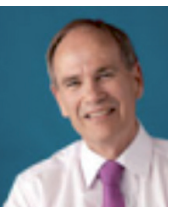
Len Brown Mayor of Auckland

He has led many high-level Government Reviews and Commissions, including the Garnaut Climate Change Review (2008). Ross was appointed as an independent expert advisor to the Multi-Party Climate Change Committee in September 2010 and was commissioned in November 2010 by the Minister for Climate Change and Energy Efficiency to update significant elements of his 2008 Climate Change Review.